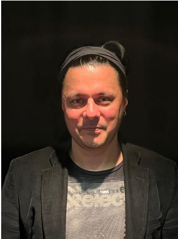
Second Lieutenant Ralph Clark – a young, ambitious, married officer who takes on the task of directing the play. He falls in love with Mary.