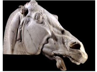
HORSE OF SELENE from the Parthenon, Athens 438-432 BC

imagines himself as a high priest sacrificing children on an altar. He alludes to a number of specifics "...the so-called mask of Agamemnon found at Mycenae" and "...the lumpy pop-eyed masks, also found..." Describing his own state of mind to Hesther, Dysart claims, "Mentally... I'm in some Doric temple..." (Sc.18). When he describes Alan's ecstatic experience with horses, once again the imagery is Grecian, "I sit looking at pages of centaurs trampling the soil of Argos – and outside my window he is trying to become one, in a Hampshire field!" (Sc.25). The inner conflict in Dysart's mind, as it is played out in his encounter with Alan, is really a dialectic between the Rational and the Ecstatic.