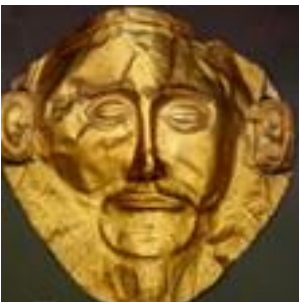
MASK OF AGAMEMNON Mycenae 1550–1500 BC

The first vital Greek image comes when Dysart relates a dream (Sc. 5) in which he